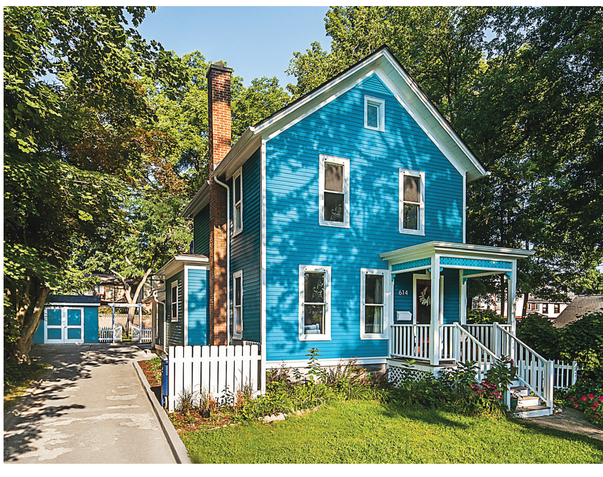
"After"